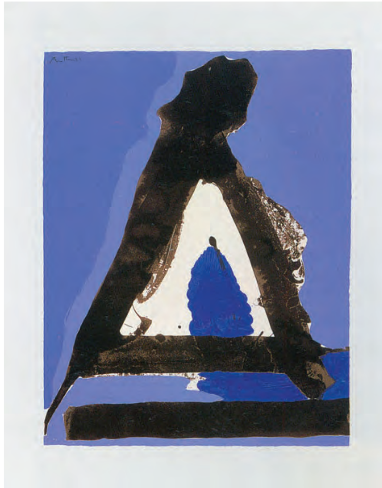
Robert Motherwell's Untitled , from "The Basque Suites," 1971, at New York's Marlborough Gallery.

OCTOBER 2010 THIS MONTH'S CULTURAL AGENDA